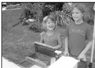
LRF's youngest supporters turn lemons into lemonade for lymphatic diseases