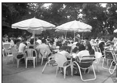
Young and old enjoy dinner and bingo