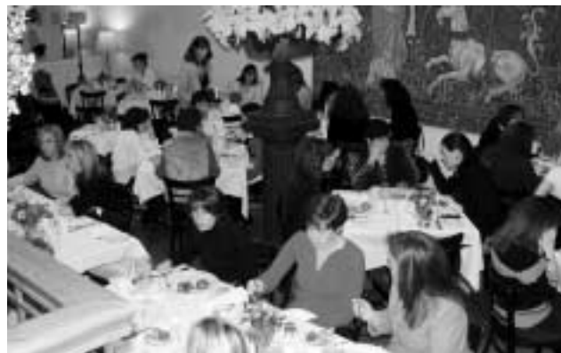
Bottom: Champions for Charity® breakfast at Millie's Place