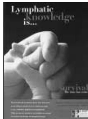
First Place Winner